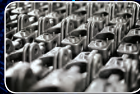
Oil Gun Parts