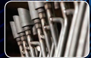
Flare Parts & Ignition Systems