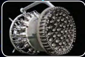
Replacement Flare Tips