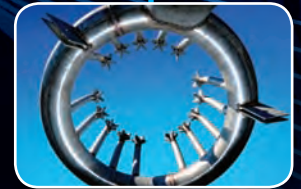
Upper Steam Ring