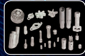
PARTS & SERVICE

COMBUSTION AND ENVIRONMENTAL SOLUTIONS. PURE AND SIMPLE.®