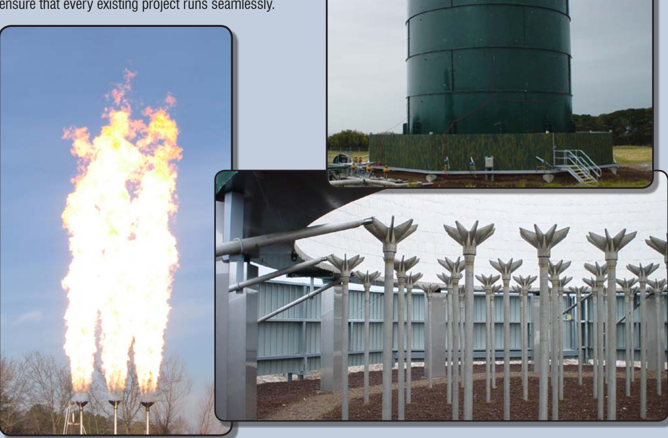
100% Xylene Testing in Zeeco's Test Facility