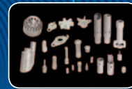
PARTS & SERVICE

COMBUSTION AND ENVIRONMENTAL SOLUTIONS. PURE AND SIMPLE.®