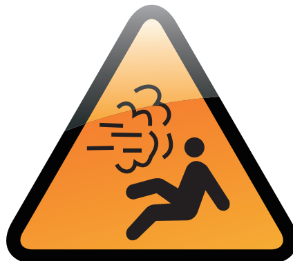
Low Concentration Leak Detection