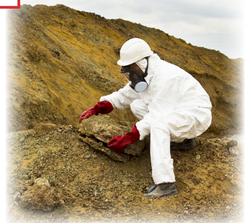
Soil Contamination & Remediation

The piD-TECH eVx saves considerable time and money in product research and development costs to implement photoionization detection into your products.