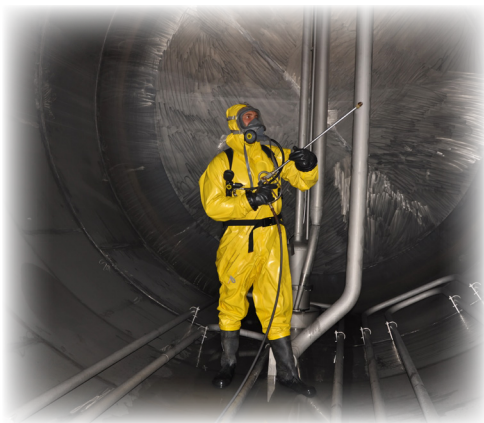
Confined Space Entry